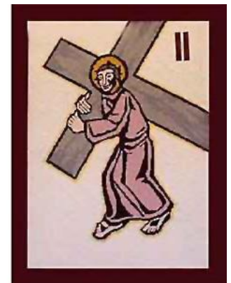
Soldiers put a heavy cross on Jesus' shoulders.